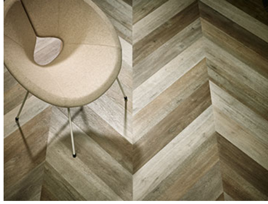
Hungarian Point Option 1

Install the remaining rows, starting in the centre and working to both sides of the room, making sure that you work parallel to the drawn centre line.