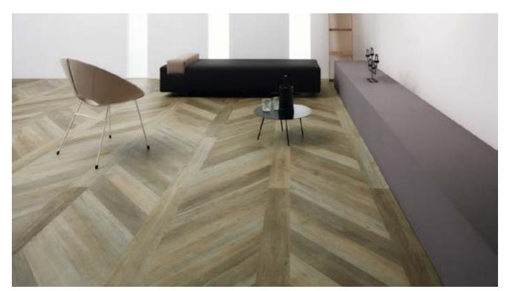
Hungarian Point Option 2